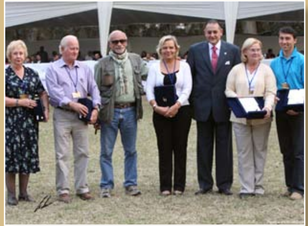
The Judges Of National Show and Organizer