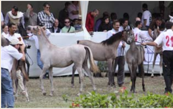
Stand-ups even for the babies

age, they need to be in a herd together with other foals. You can see baby foals here, without their dams, and they are just absolutely disturbed.