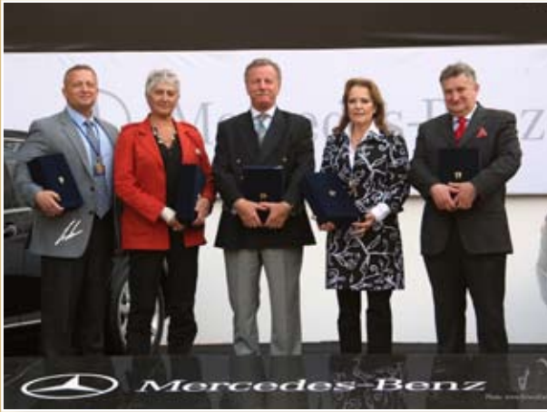
The Judges Of International Show