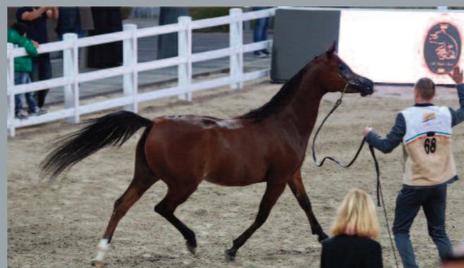
FOTNA AL BAIDAA