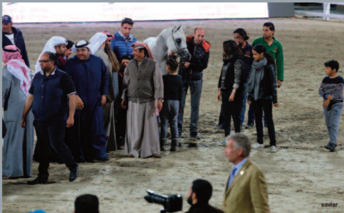
EZZ AL DANAT