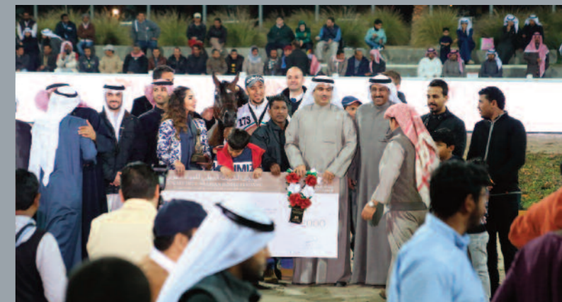
EIGHT NATIONS TOOK PART IN THE RACE FOR THE TITLE: "ALL NATIONS CUP- STRAIGHT EGYPTIANS"