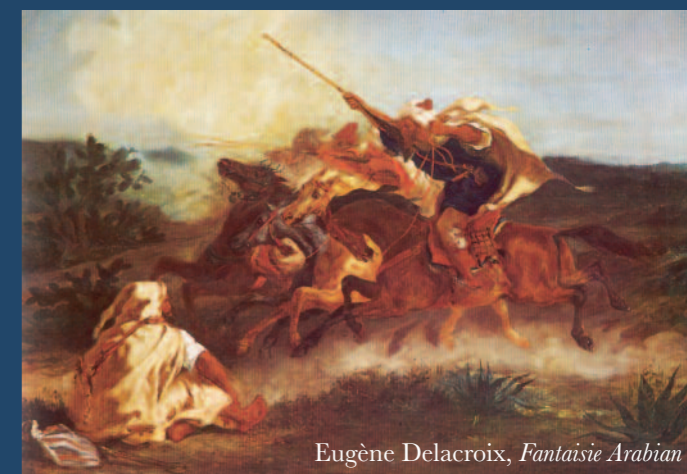
Eugène Delacroix, Fantaisie Arabian

Savier: After all, we have enough good foals even without artificial means of breeding. Many good foals never make it to the deserved top because their owners