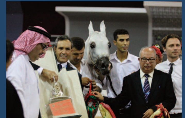
TS Apolo, Senio Gold Champions, Haras Royal De Bouznika