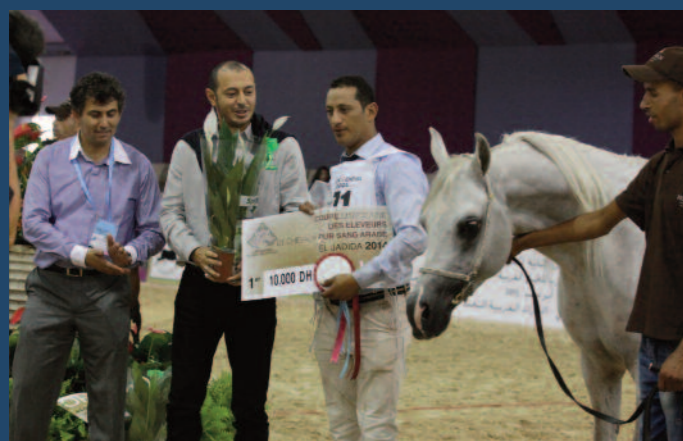
Bamanssour, Gold Champion Senior Stallions, Haras Royal De Bouznika