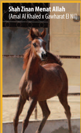
Shah Zinan Menat Allah (Amal Al Khaled x Gawharat El Nil)