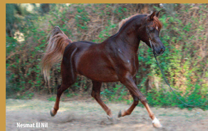
Nesmat El Nil