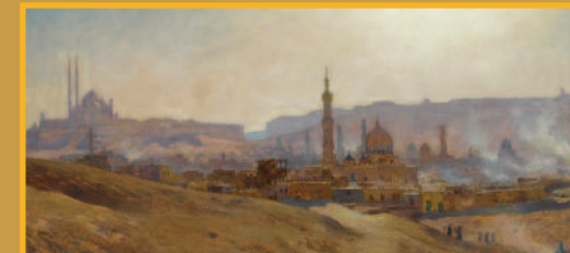
Etienne Dinet, Cairo, 19 th Century

A group of breeders from Germany, Italy, and Switzerland had followed the call of Pyramid Society Europe to come and visit the shows in Cairo in November. Once there, they would not go without visiting some significant studs as well, in order to get an insight into the breeding concepts, the horses, and their way of living. Having a look behind the scenes is always fascinating and makes for fresh experiences. Sometimes, new contacts will result, stimulating the market for stallions or making interesting new connections for breeding possible. In today's media world of pictures, it is more important than ever to be able to have a personal close look at horses, also inspecting their offspring, so as to get to a realistic assessment of their value for the globalized breeding of our