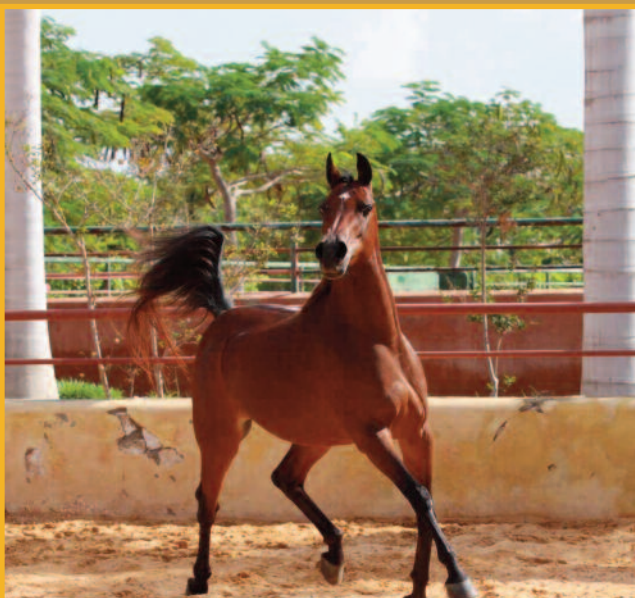
Amirah Moon MH (Haliluyah MH x Moon-Storm)

Savier: Thank you very much, Ali. We will discuss the Straight Egyptians in Egypt in some more detail in the next issue of our Desert Heritage Magazine.