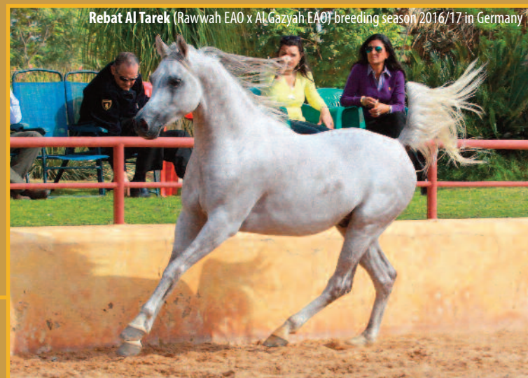
Rebat Al Tarek (Rawwah EAO x Al Gazyah EAO) breeding season 2016/17 in Germany