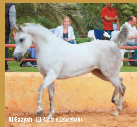
Al Gazyah (El Ragel x Zebeebah)

We all wish you good luck for your farm and your stallion.