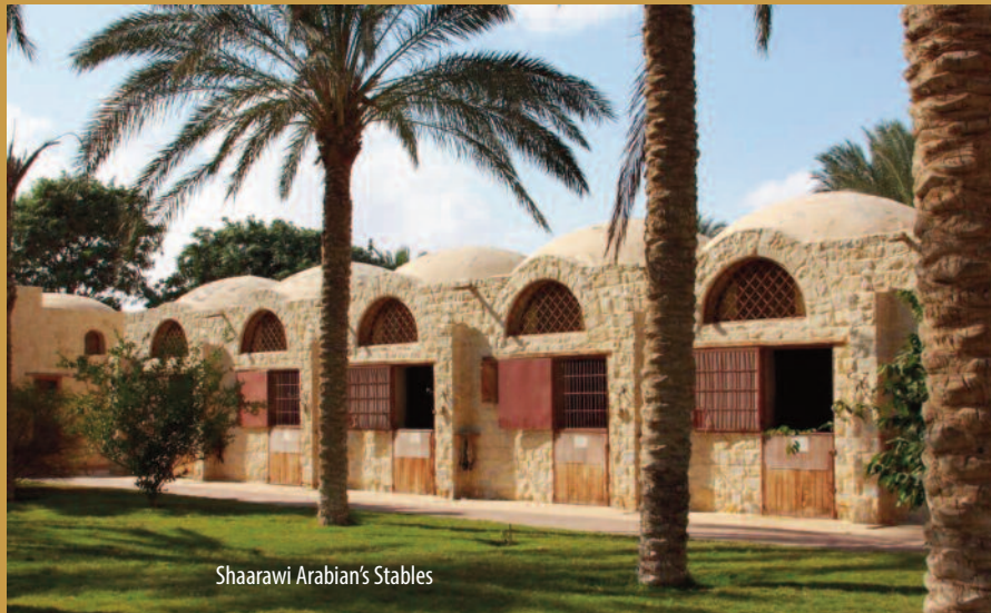
Shaarawi Arabian's Stables