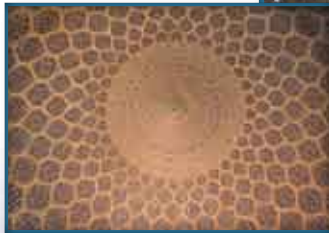
The old Abasi caravanserai, today one of the most famous hotels in Iran