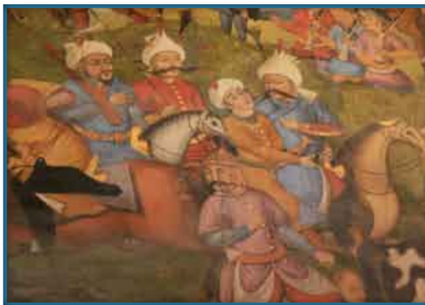
Medieval Frescoes in the Chehel-Sotun-Palace, Esfahan