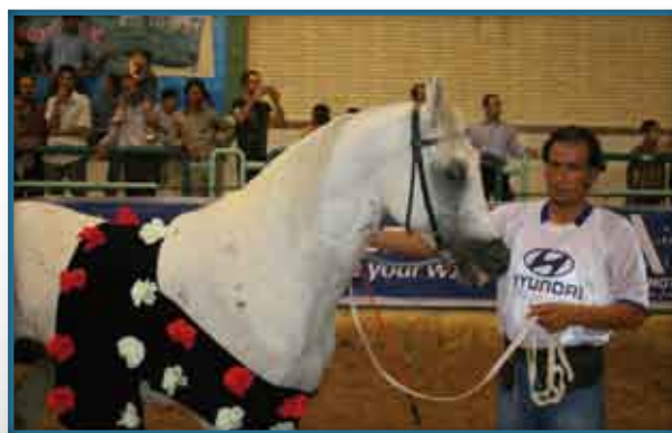
Zarrin (Ghazal x Sassan) Owner: Samangane Haji Samei, Shiraz

as compared with most show horses in Europe: we can be sure she is never bored, for she is a broodmare as well as a riding mount, a racing horse, and a show horse – whatever is required by the situation. And after all, this is exactly what we always claim our horses to be: these noble Arabian horses are all-rounders. □