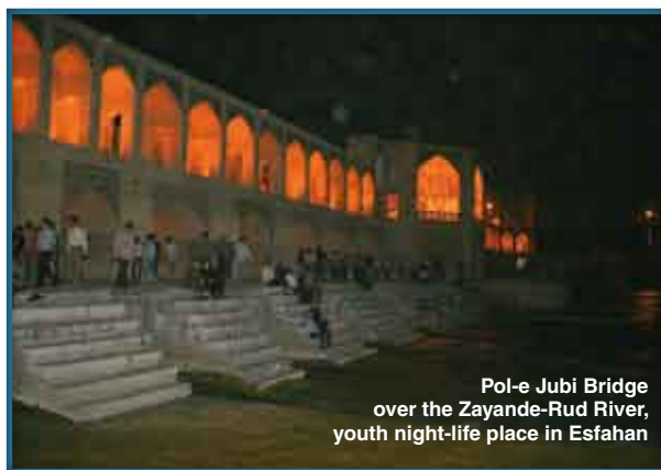
Pol-e Jubi Bridge over the Zayande-Rud River, youth night-life place in Esfahan