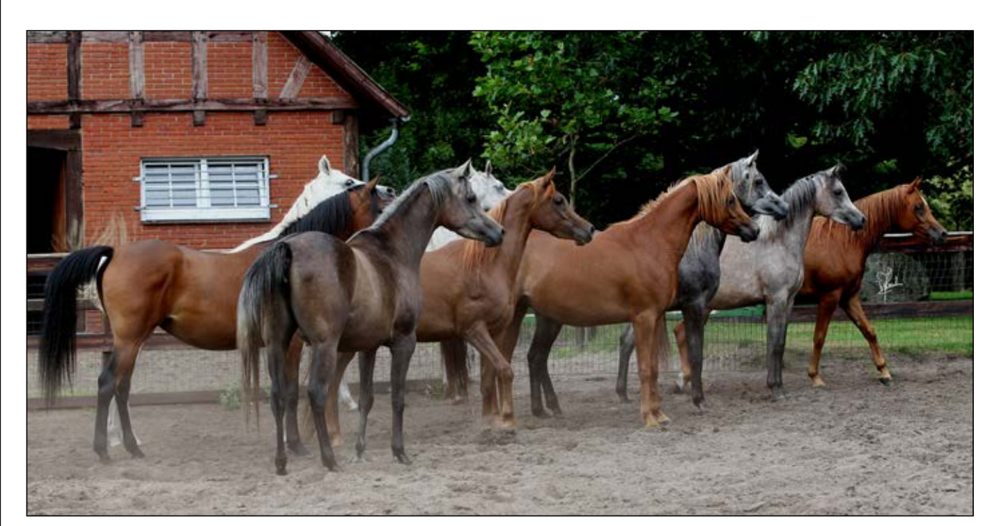
Bunch of Mares at the Katharinenhof