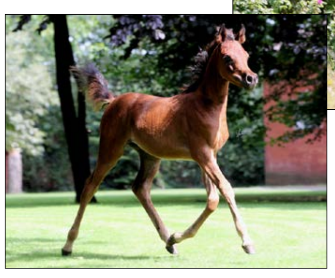
NK Nay (NK Nabhan x NK Nawal)

and structure, and also in his capacity to be an inheritor. In two years, he produced 20 offspring already, which offer a good base for evaluation.