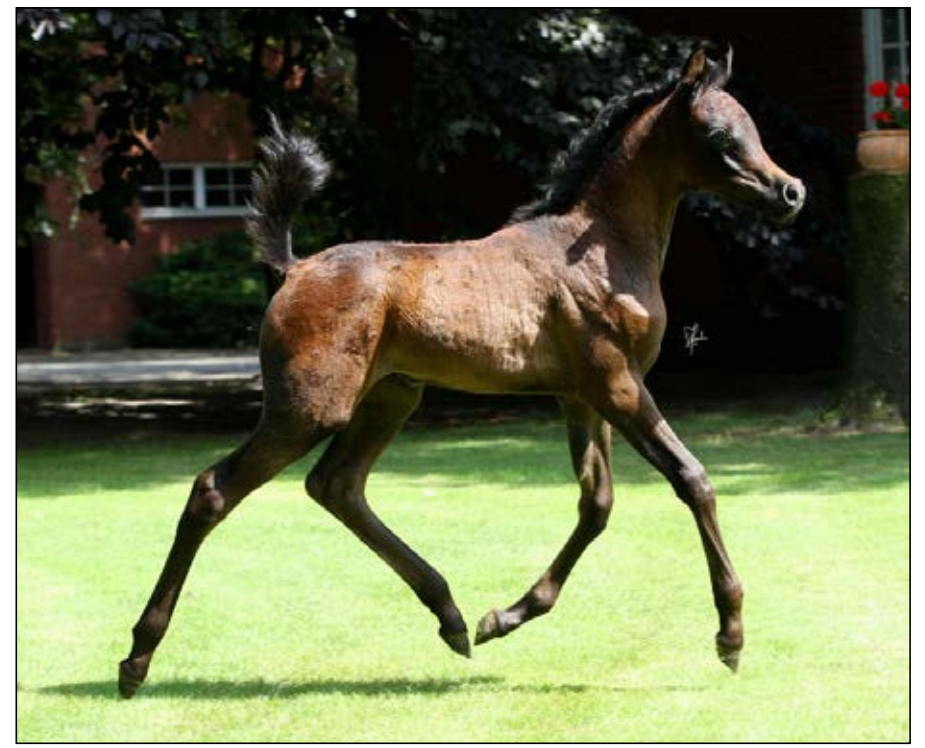
NK Naala (NK Nabhan x NK Nadirah)