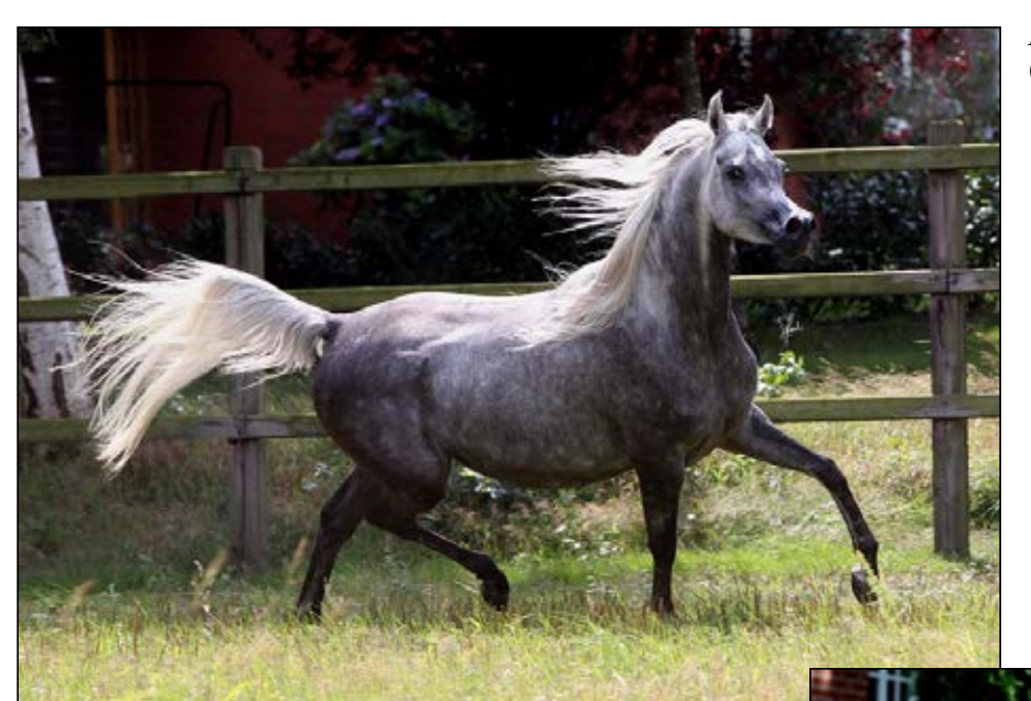
NK Nachita (NK Nadeer x Bint Bint Nashua)