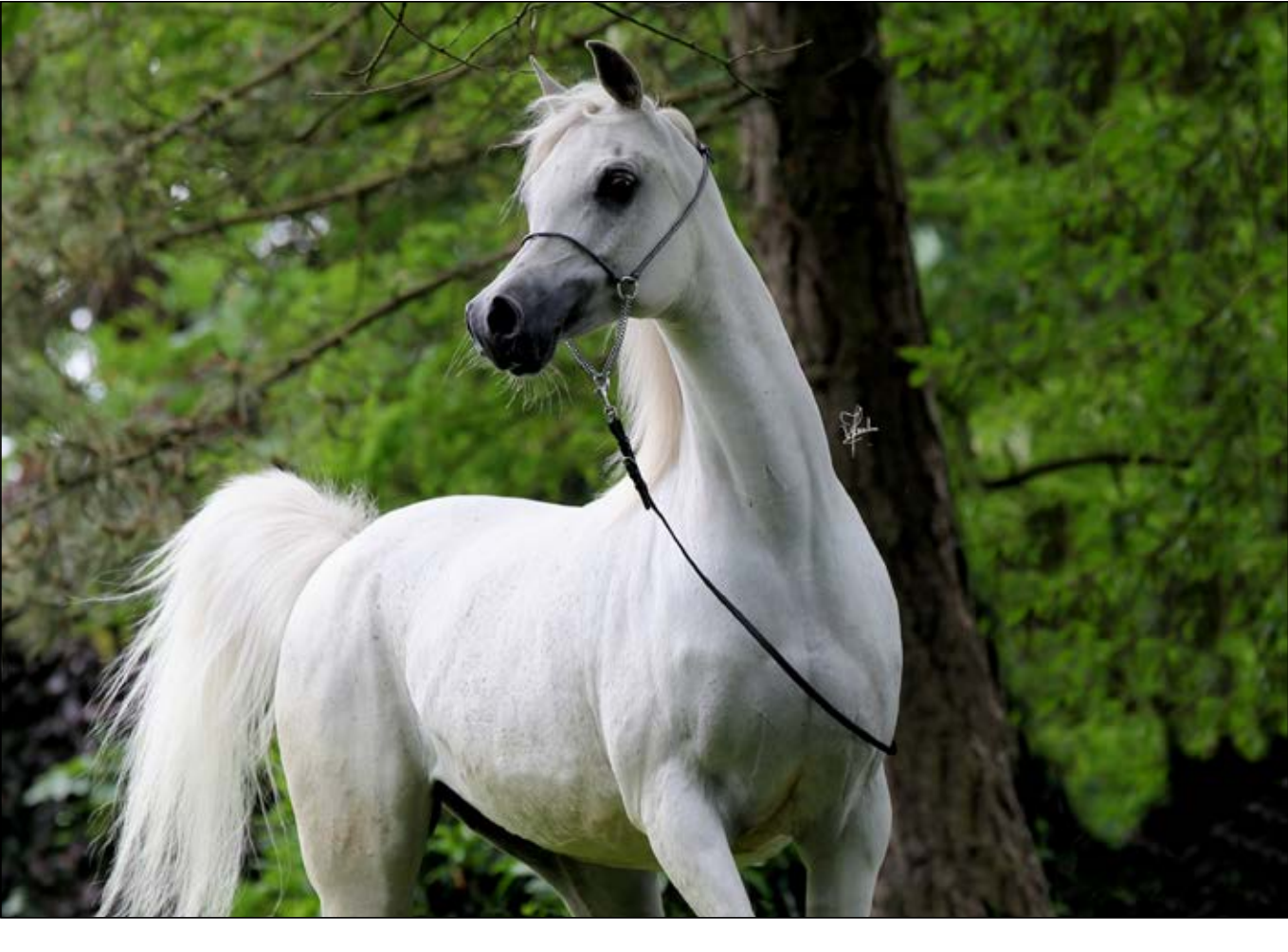
NK Nadirah (Adnan x Nashua)