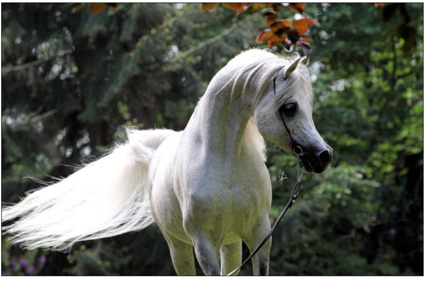
NK Nadeer (NK Hafid Jamil x NK Nadirah)

Nagel: If one takes a close look at today's population of Egyptian Arabians, only a few mares and stallions out of all these sold ones became influential and were eligible for further breeding. The majority vanished during the following generations with their offspring, or remained unimportant, be that within