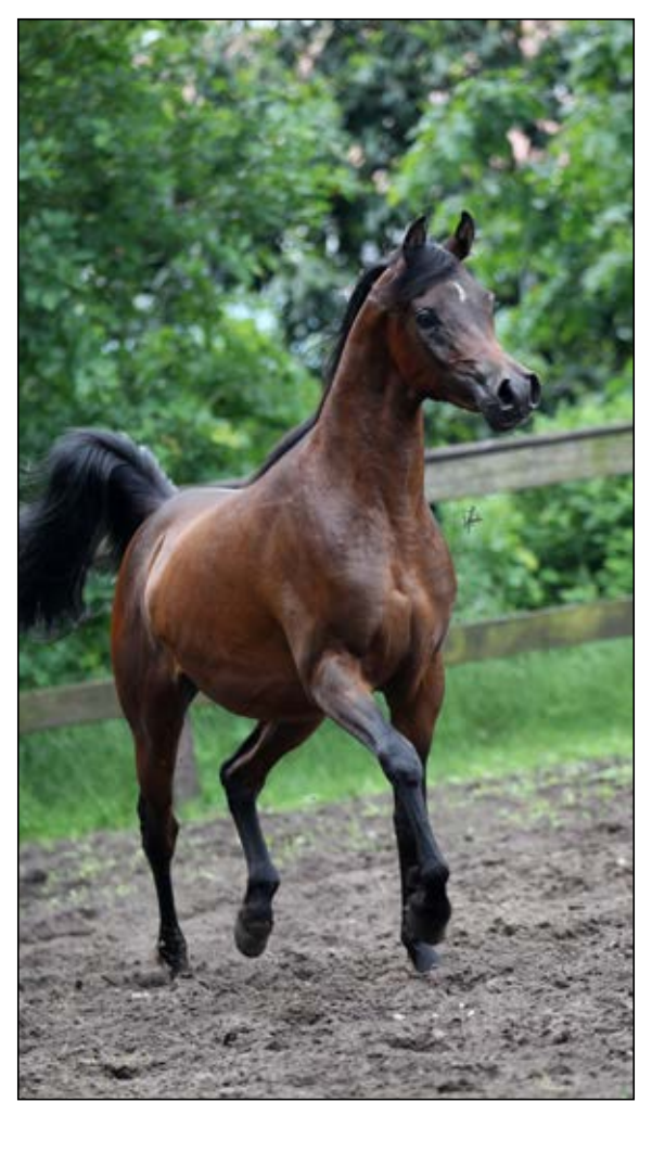
NK Nizan (NK Hafid Jamil x NK Nadirah)