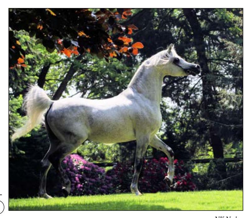
NK Nadeer (NK Hafid Jamil x NK Nadirah)