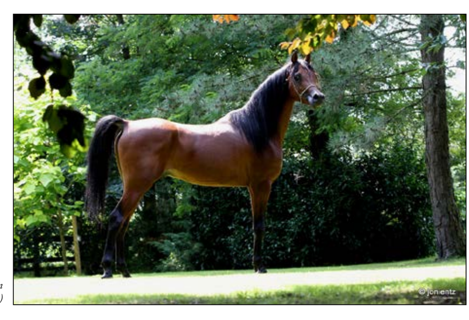
NK Nabhan (NK Nadeer x NK Nerham)

which could be related to their genetic make-up. In so far it looks like these Arabian horses, or to put it better: this specific population is highly resistant to in-breeding, and history and the arguing of so many connoisseurs of the Arabian horse as the oldest unique breed are correct. The DNA results are supporting these facts and more research in this field should be highly recommended.