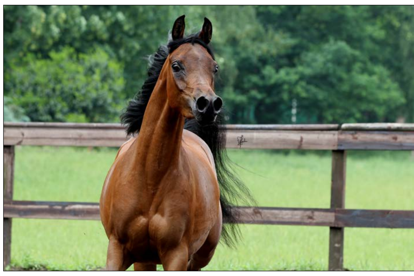
NK Nabhan (NK Nadeer x NK Nerham)