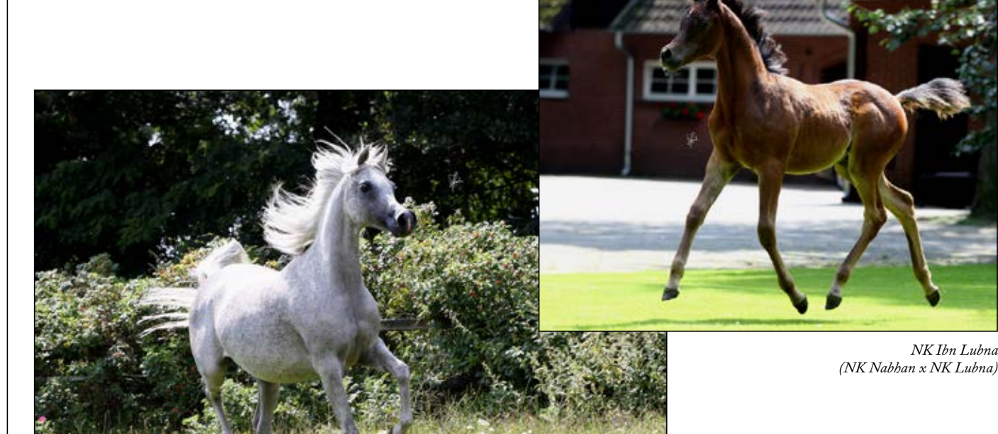
NK Lubna (Jamal El Dine x NK Layla)

3. In addition, the choice was made by considering that all required characteristics and features of a typical Arabian should be present in these four groups in a most perfect manner. It was and is not a question of a single horse which combined them all, but they should be available and found in perfection, spread and visible in one or the other horse.