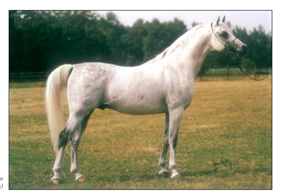
Salaa El Dine (Ansata Halim Shah x Hanan)