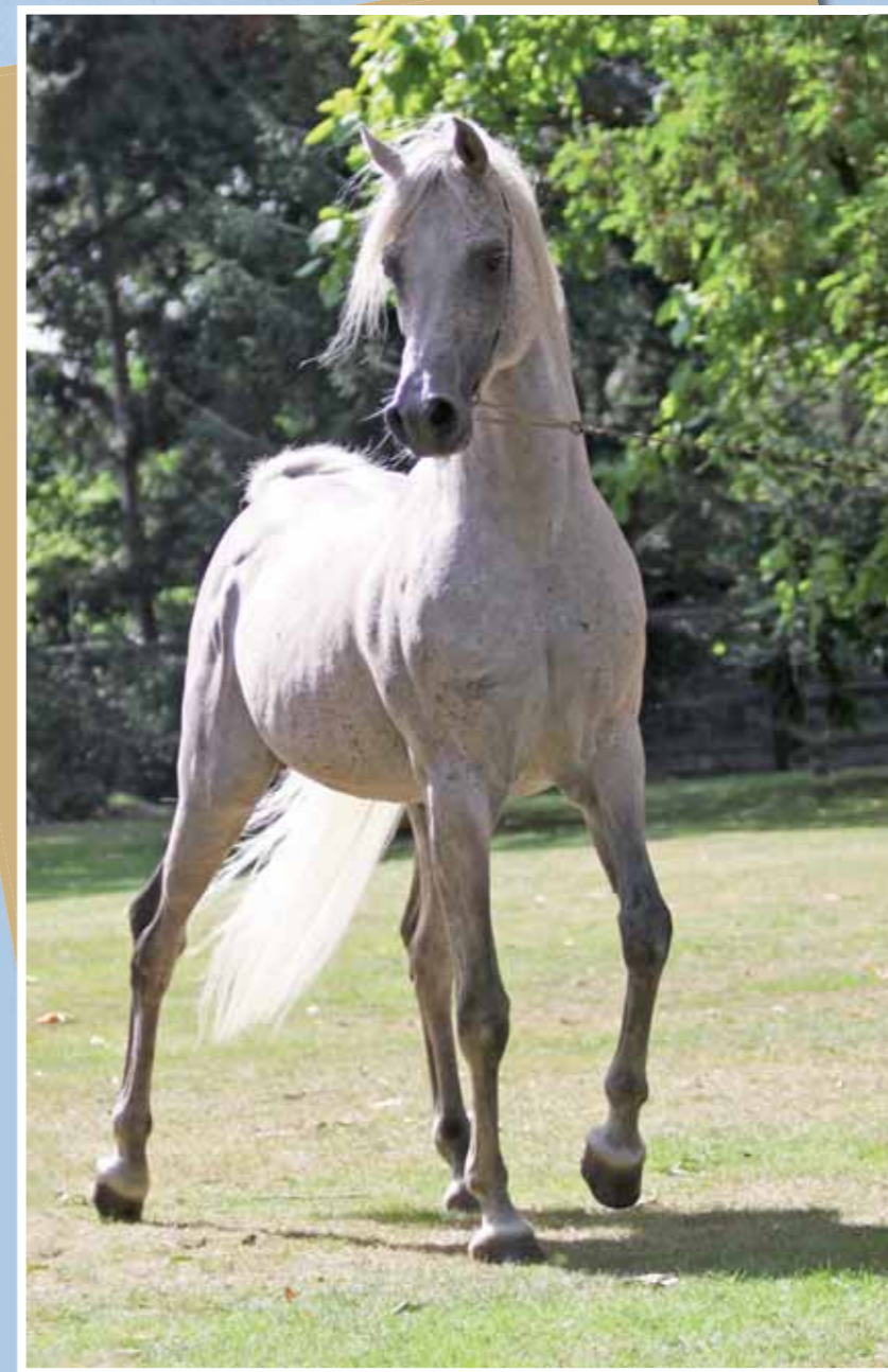
NK HAFID JAMIL (Ibn Nejdy x Helala)

Again and again and ever patient, he encourages the countless visitors from Europe, from the Middle East, the US, and Australia. He encourages them to breed, to maintain this precious breed of horses. He tries to interest them, to motivate them, to encourage them to define a breeding goal of their own. He is a role model for small breeders: his stock was deliberately designed not as a numerous population offering a playing ground for grand experiments, but as a small herd on a private stud, based on a concept of quality, not of numbers, and managed with a well-grounded expertise in genetics. This made for successful implementation of his concept. A concept serving as a fascinating model for most private breeders, as the lessons of experience collected here are most probably conferrable and practicable to small studs everywhere. □