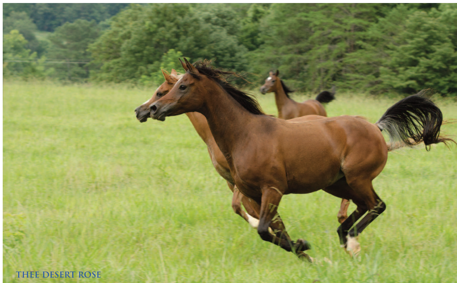
THEE DESERT ROSE

About technology and horse reproduction: the USA are renowned for their advanced reproduction technology. In embryo transfer, we now have the discussion on epigenetics and the genetically manifest influence of the recipient mare on the embryo in her uterus. Therefore, we can basically talk of three parents now: sire, dam, and recipient mare. For SE breeders, keeping the breed pure has been always the big credo. What's the reaction of the SE horse industry in the US to these facts?