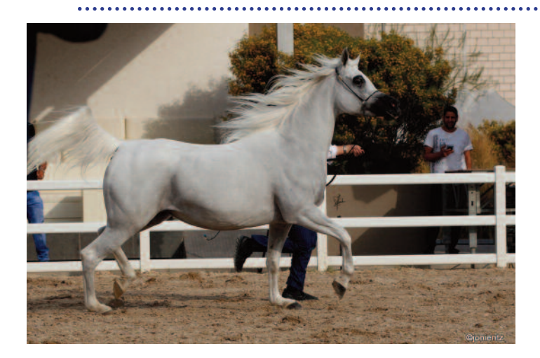
Championship Senior Mares

Gold CF SHAMILA Silver NAWAAL AL RAYYAN Bronze FOTNA AL BAIDAA