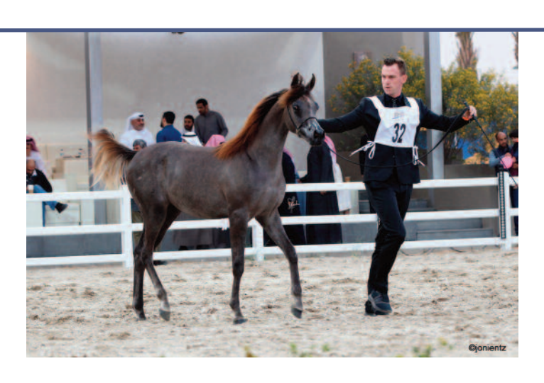
Championship Yearling Fillies

Gold BOSMAT AA Silver AB MUHRA Bronze DHAY AL HILALIYA