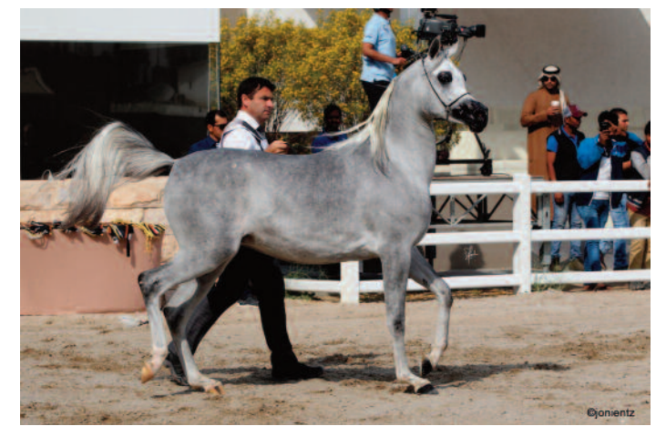
Championship Junior Fillies

Gold AB FARIDAH Silver ZAINAH AL NAWASI Bronze RAYYANAH AL MAALE