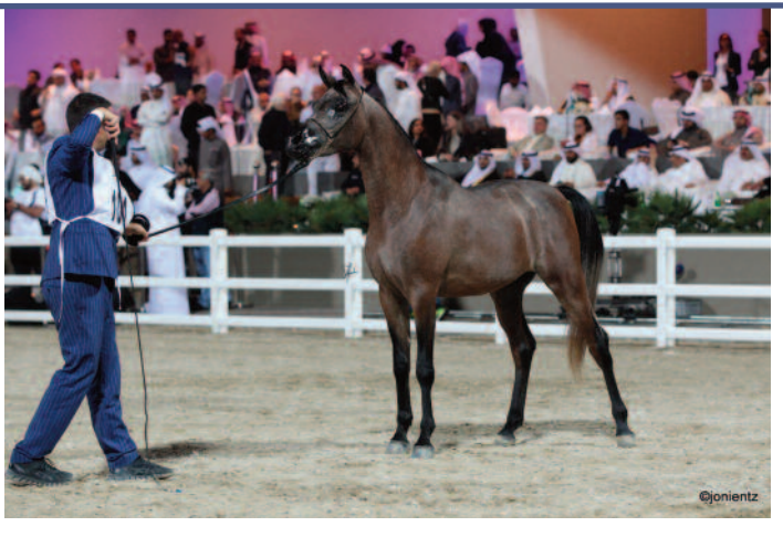
Championship Senior Stallions Gold PSE AL RAKHAN Silver NASEEM AL NAKEEB Bronze D MONAF