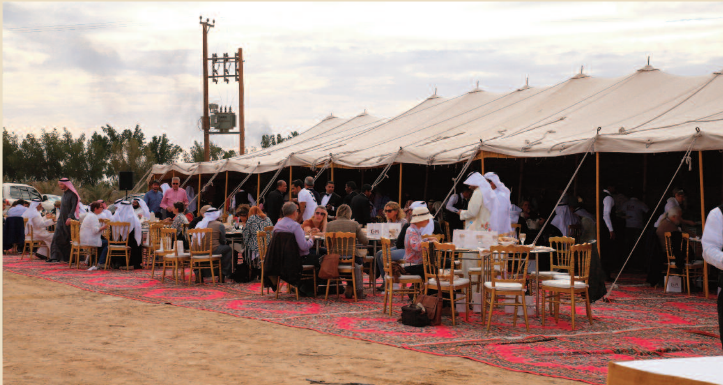
Free-running groups of peacocks accompanied us to the tent with lunch, camels, and falcons. This is how we will remember Hayrat Al Hilaliyah Farm, a place in the desert dedicated to the beauty of animals and devoted to hospitality.